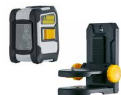
CompactCross-Laser Plus + tripod-/wall mount + batteries (2 x type AA)

Packing dimension (W x H x D) 190 x 315 x 200 mm