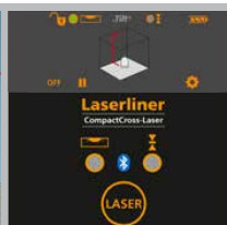
Digital control panel (using app)