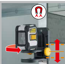
Multi-functional tripod-/wall mount